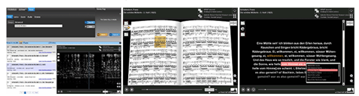
Fig. 2. The Probado Music webinterface for query formulation, result presentation, and document access.

Probado Music is a multimodal digital library system that allows worldwide access to various music material [5]. Besides streaming and presenting digital music documents (in particular scanned sheet music, audio recordings, and lyrics), Probado Music employs current techniques from the field of music information retrieval to offer enhanced browsing, navigation, and search functionalities [6, 8, 9, 11]. The frontend for document retrieval and access is depicted in Figure 2. Besides classic metadata search, content-based search techniques are incorporated as well. Thus, score-, audio-, or lyrics-extracts can be used as queries. After selecting an entry from the hit list, all documents containing the according piece of music are prepared for presentation. To this end, the Probado Music system offers three distinct visualizations (score, audio, and lyrics) between which the user can freely navigate. As further feature, the current playback position in the selected audio recordings is highlighted in all visualizations (i.e., the current measure in the score and the currently audible word) through the application of music synchronization techniques. As further result of this synchronization, the score or the lyrics can be used for navigation in an audio recording. Additionally, if several audio interpretation are available, the user can switch between them while maintaining the musical position.